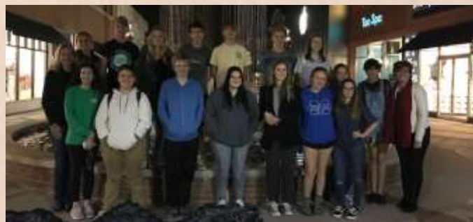
Senior High Youth Mall Madness Lock-in